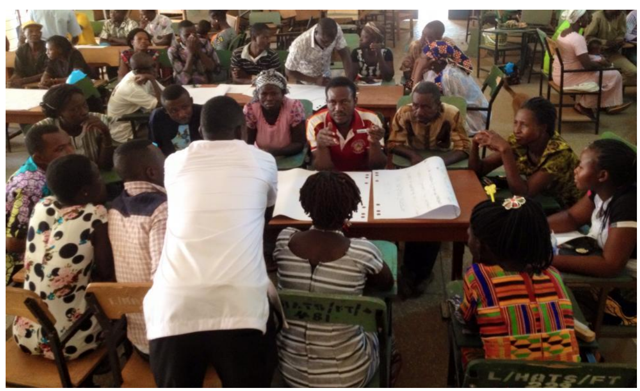
Figure 2: Group work at the Evaluating Success Conference

To review and discuss the results of the project ensuring the experience and perspectives of all core team members is taken into account