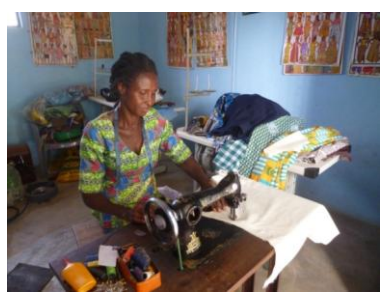
Figures 4, 5 & 6: SBOs visited by the Independent Evaluator; a mechanic, a petty trader and a seamstress