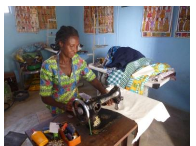
Figures 4, 5 & 6: SBOs visited by the Independent Evaluator; a mechanic, a petty trader and a seamstress