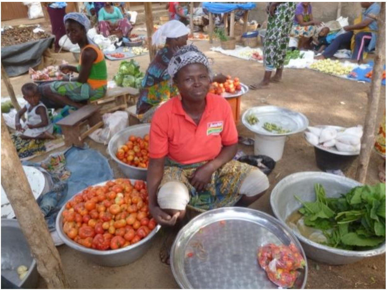
Figure 1: Akose, a BizATE-supported Small Business Owner visited by project evaluators at Lawra Market

The evaluation received generous funding from the Commercial Education Trust (CET) which enabled ATE to make the evaluation really rigorous. The team included an independent evaluator (Dr. Nick Maurice) as well as a dedicated ATE team both Lawra-based and UK-based. The evaluation activities included one-on-one interviews and written surveys covering 40 of ATE's existing Small Business Owners (SBOs) and 31 of ATE's Lawra-based consultants, 4 days of workshops attended by SBOs and consultants, training and many on-site visits to the Small Business Owners.